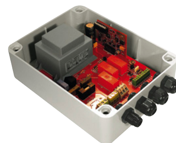
UPTWAS + DTWRX